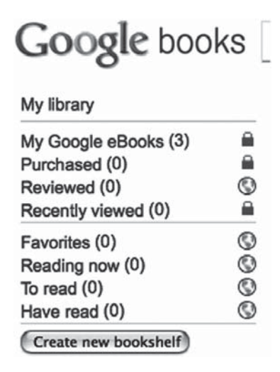
Figure 2.2 My Library image