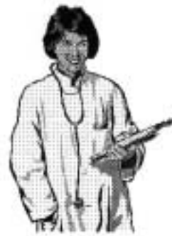
High Authority Female Primes

Procedure. The procedure followed that of Fazio et al. (1995). Computerized instructions informed participants that the task measured their ability to memorize pictures while judging the meaning of words.