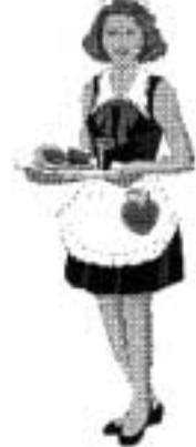
Figure 1 Examples of schematic women used as priming stimuli.

Participants' task was to press a key labeled "good" or a key labeled "bad" as quickly as possible to indicate the valence of 24 adjectives (12 positive, 12 negative). The procedure involved five phases. In Phase 1, participants performed a baseline task of 48 trials in which they responded to each adjective twice. The adjectives (randomly presented) were preceded by a row of asterisks presented for 450 ms. Adjectives remained on the screen until participants indicated their judgment. A 2.5-s interval separated each trial. The mean latency for the two trials involving each adjective served as that adjective's baseline latency.