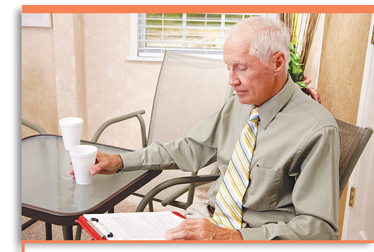
Photo 16.2 The person in this picture is reviewing application material prior to interviewing a job candidate. What are the other responsibilities of an interviewer prior to the interview?

Exhibiting knowledge about the organization during the interview will convey proper preparation, enthusiasm for the position, and a desire to become part of the organization. As we will discuss later in the chapter, exhibiting knowledge about the organization is a distinguishing characteristic of successful and unsuccessful interviewees. Such information may include the organization's history, future plans, challenges, accomplishments, and other characteristics. Exhibiting