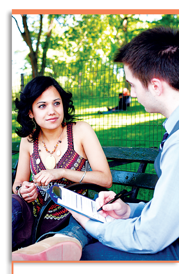
Photo 16.1 What is the difference between information-gathering interviews like the one pictured here and persuasive interviews? Is the difference always obvious to the person being interviewed?

Unlike problem-solving interviews, helping interviews are always conducted by someone with expertise in a given area and whose services are engaged by someone in need of advice. The most obvious example of a helping interview would be a psychologist asking questions of a client. However, other helping interviews include those conducted by credit card counselors with people facing a heavy debt load or attorneys advising clients on legal matters.