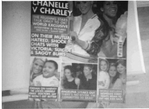
FIGURE 4 'I love magazines'