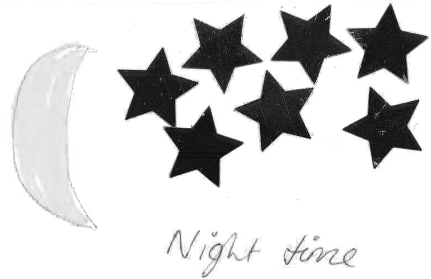
FIGURE 1 The night sky

The participants' visual data provided an opportunity to observe unseen or forgotten elements of the physical environment such as Tina's representation of the night.