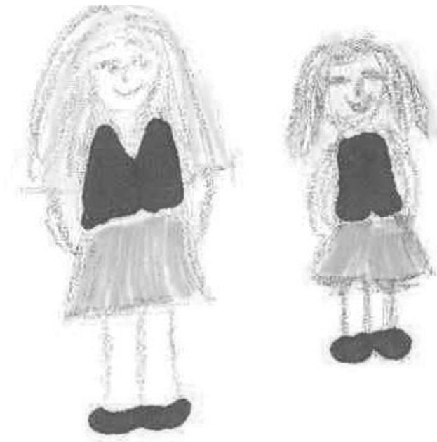
FIGURE 3 Tina's daughters – Chantelle and Louise

(Banks, 2001). The practice of creating visual data, then, presented an opportunity for Tina to transcend the visible and actual physical difference by distorting generalities of alignment. My singular interpretation was still veiled by a web of taken for granted meanings but the combination of Tina's creativity and explanation contributed to a more nuanced understanding for both the researcher and the researched.