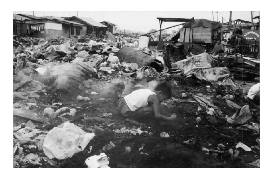
Figure 7 Panoramic scene of garbage dump of Banong Lupa.

for the natural limits imposed on other saleable body parts. ('Can I sell a testicle?' a former kidney seller from the shantytown asked me. 'Filipino men', he boasted, 'are very potent, very fertile'.)